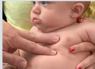
2.4. The Skin (1:42)