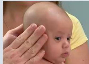
2.5. Head and Neck (2:21)