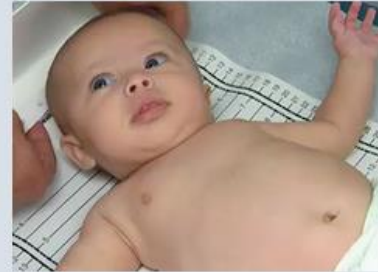
2.2. General Survey and Somatic Growth (3:11)