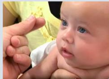
2.7. Ears and Nose (2:01)