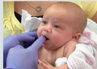
2.8. Mouth and Pharynx (1:52)