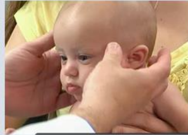
2.1. Introduction (1:44)