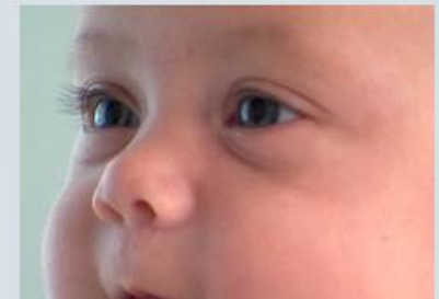
2.6. The Eyes (2:18)