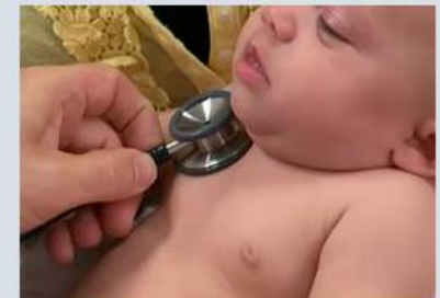
2.9. Thorax and Lungs (2:28)